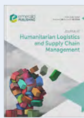
Journal of Humanitarian Logistics and Supply Chain Management