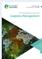
The International Journal of Logistics Management