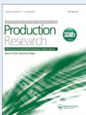
International Journal of Production Research

The abstract will be published in the conference proceedings. The selected best papers will be considered for publication in reputed journals as per the journal-specific review process. Here is a list of journals associated with the conference for fast-track publication based on the peer review process.