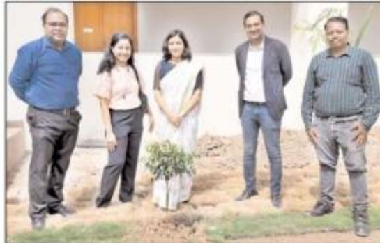
Industry speakers at IIM Jammu for participation in orientation programme.