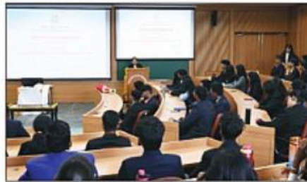
Participants during Day 2 of Orientation Programme at IIM Jammu on Saturday.