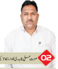
02 سب سے سلی پرہیز کا ادارہ 74 کی تیر ورتی کا شہن رواں دواں

Volume : 38 | Issue No. 239 Pages:12 | 5 | Sunday 03 September 2023 | 17 صحتن 1445 | 03 ستمبر 2023 | 5 ایشوار | 38 جلد نمبر: 299 قیمت: 5 ایشوار