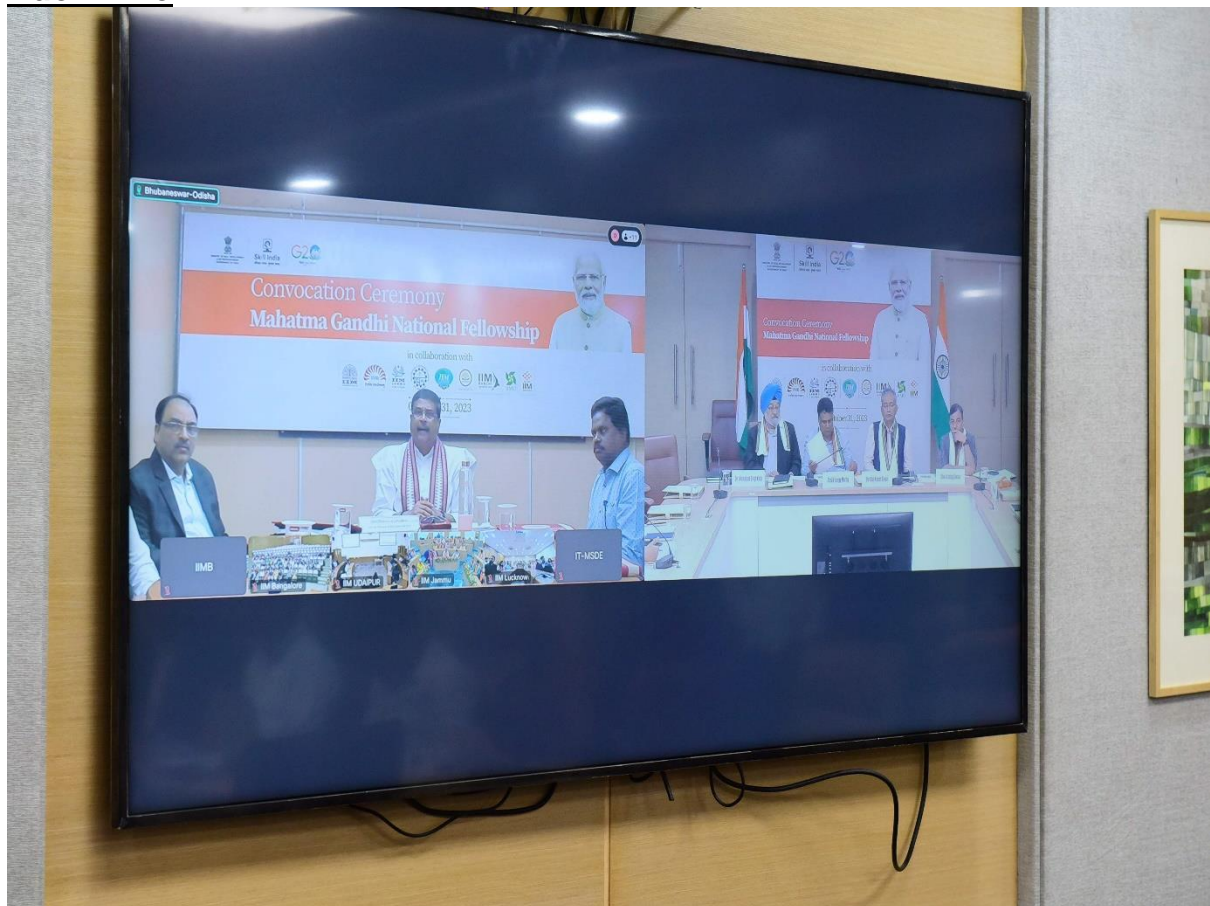
Minister Pradhan joining virtually | (Pic: Souced)