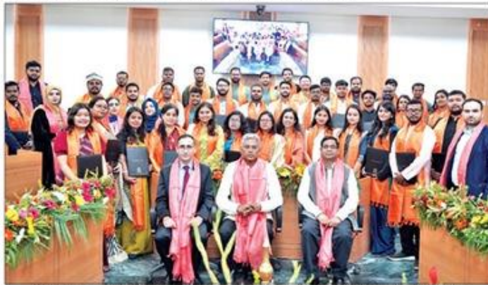
IIM Management along with students during the convocation ceremony in Jammu.