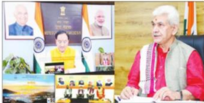
Lt Governor Manoj Sinha addressing inaugural function of Anandam-The Center for Happiness at IIM Jammu

Highlighting the significance of "Anandam- The Center for Happiness", the Lt Governor observed that the new center emphasizes on holistic well-being of students, just like the Center for Meditation. Terming Self-revelation as an integral part of Gurukul education tradition, the Lt Governor said that centers like Anandam have worldwide paved the way for education to become a vibrant force and to know oneself. Now, the IIM Management students in Jammu will also be able to experience the