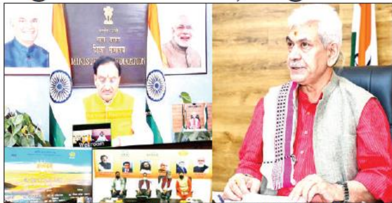
LG Manoj Sinha addressing inaugural function of 'Anandam, the center for happiness' at IIM Jammu.

Terming Self-revelation as an integral part of Gurukul education tradition, the