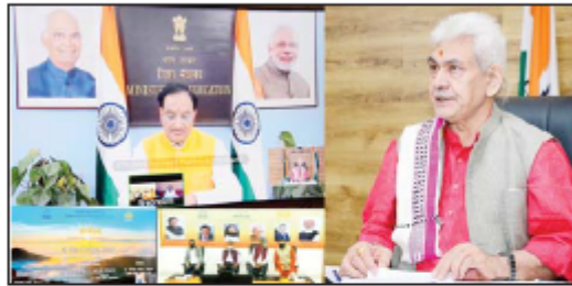
Union Minister Ramesh Pokhriyal and Lt Governor Manoj Sinha addressing inaugural function of 'Anandam' the centre for happiness at IIM Jammu.

"The right way to measure wealth is to measure happiness and not just money", said the Lt Governor. Staying happy is the best prayer that anyone can offer to God and is the real idea of happiness, he added.