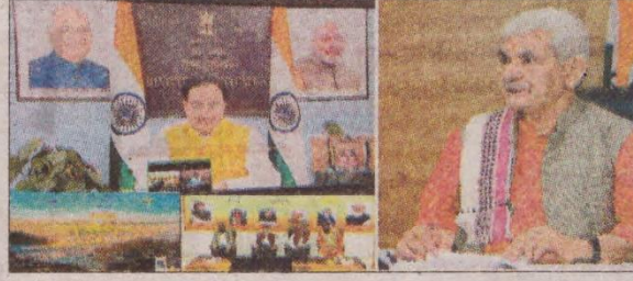
आनंदम-द सेंटर फार हैप्पीनेस का उद्घाटन करते केंद्रीय मंत्री एवं उप-राज्यपाल मनोज सिन्हा।

उप-राज्यपाल मनोज सिन्हा ने युवाओं से कहा कि आंतरिक प्रसन्नता संतुलित जीवन पर केंद्रित है जिसे ध्यान एवं योग के माध्यम से मौजूदा चुनौतियों से निबटा जा सकता है। आनंदम-द सेंटर फार हैप्पीनेस के महत्व को बताते हुए उपराज्यपाल ने कहा कि यह नया सेंटर सभी स्टूडेंट्स का सर्वांगीण ध्यान रखेगा। आत्म अवलोकन को गुरुकुल शिक्षा पद्धति का हिस्सा बताते हुए उप-राज्यपाल ने कहा कि आनंदम शिक्षा के क्षेत्र में महत्वपूर्ण फोर्स बनेगी ताकि स्वयं को