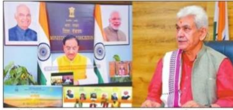
आईआईएम जम्मू में आनंदम केंद्र के शुभारंभ के दौरान एलजी मनोज सिन्हा।

जम्मू ने अनोखी को पहल की है। संस्थान ने आनंदम - दि सेंटर ऑफ हैप्पीनेस शुरू किया है। इसमें विद्यार्थी आधुनिक जीवन की चुनौतियों के बीच खुशमिजाज जीवनशैली का पाठ पढ़ेंगे। मंगलवार को उप राज्यपाल