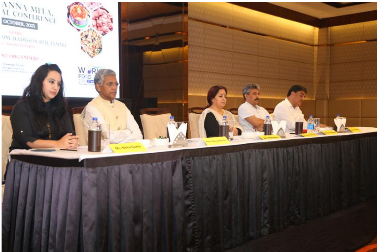
Dignitaries seated on dais during Millets Mela at IIM Jammu on Thursday.

JAMMU, Oct 5: Indian Institute of Management Jammu (IIM), in association with Dalit Indian Chamber of Commerce (DICCI) and Theta Foundation for Development hosted the Shree Anna Mela (Jammu Millets Mela) and Technical Conference, organized by the Ministry of Food Processing Industries, here today.