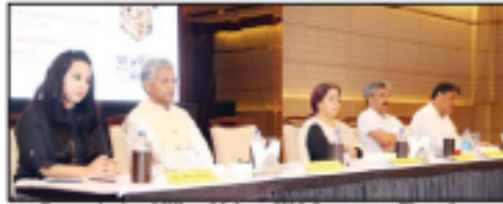
Guests during Millets Mela at IIM Jammu on Thursday.