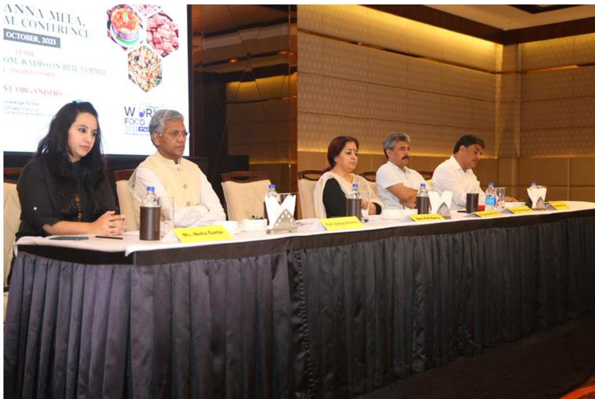
Dignitaries seated on dais during Millets Mela at IIM Jammu on Thursday.